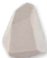
TM302 Rainy Day