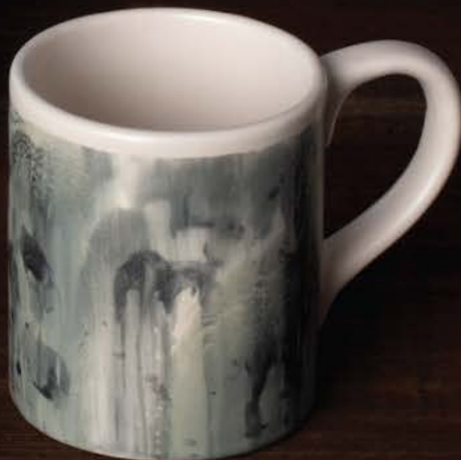
21437 12 oz. Plain Mug

Duncan® True Matte® Glazes: TM301 Marshmallow, TM319 Elephant Ears, TM321 Dusty Sage, TM326 Sting Gray