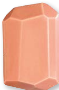
TM320 No Way Rosé