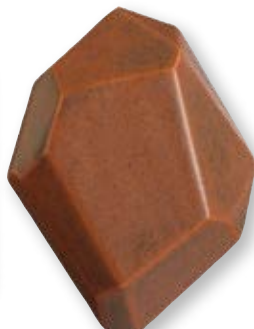
TM324 Cold Brew