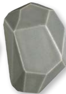
TM326 Sting Gray