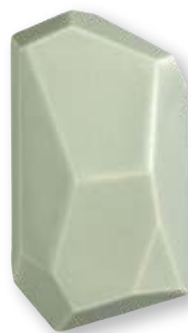
TM321 Dusty Sage