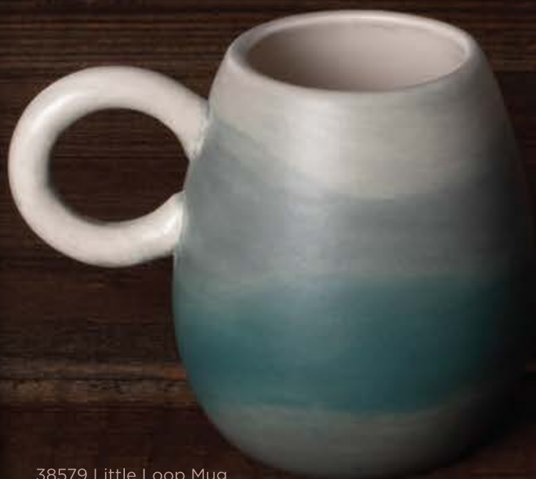
38579 Little Loop Mug

Duncan® True Matte® Glazes: TM301 Marshmallow, TM319 Elephant Ears, TM321 Dusty Sage, TM326 Sting Gray