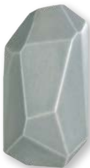
TM319 Elephant Ears