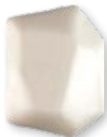
TM301 Marshmallow Crème