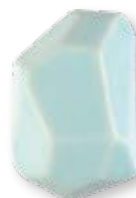
TM306 Baby Blues