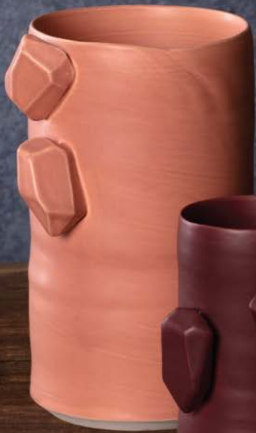
TM320 No Way Rosé

Also great for use on white, low-fire clay bodies